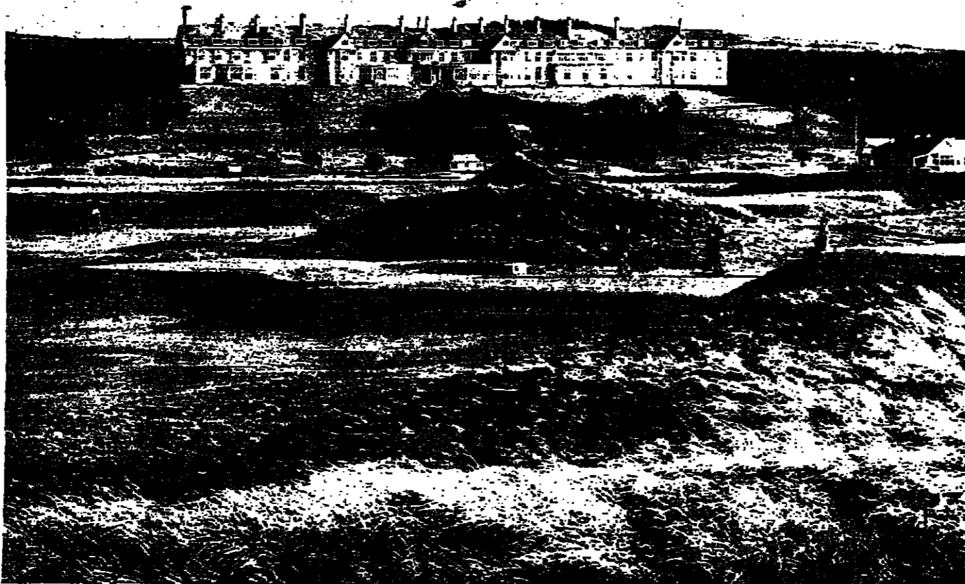
THE TURNBERRY HOTEL from the 6th tee of the Ailsa Course: The British Open takes place at Turnberry in Silver Jubilee Year.